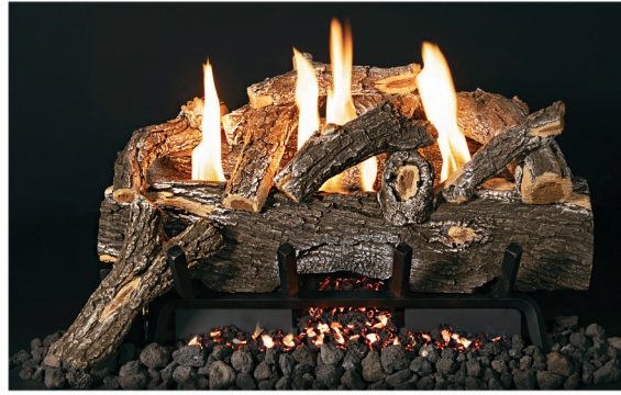
24" Weathered Oak Gas Logs