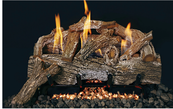
24" Red Oak Gas Logs