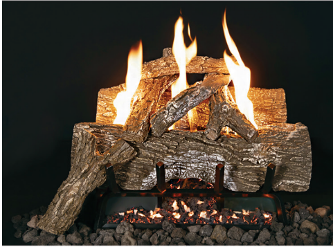
18" Red Oak Gas Logs