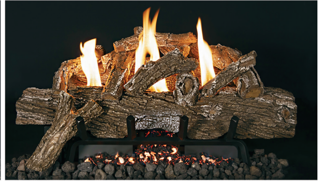
30" Red Oak Gas Logs