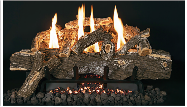
30" Weathered Oak Gas Logs