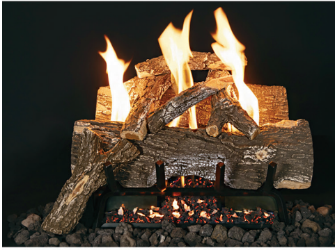
18" Weathered Oak Gas Logs