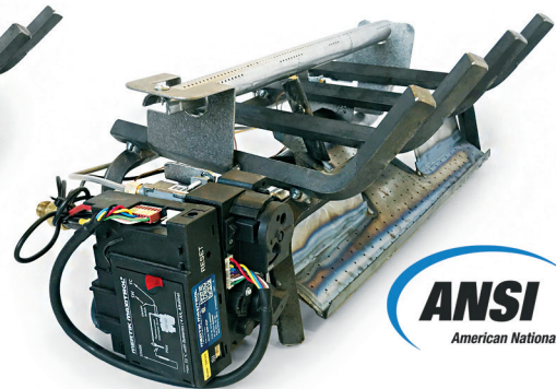
IPI Electronic with Burner Puck Remote included with this Variable Electronic model only.