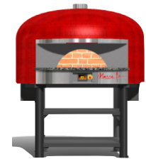
Specifically designed for use with gas and solid fuel pizza ovens