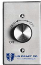
Standard US Draft Co Speed Control set to maintain proper draft at all times